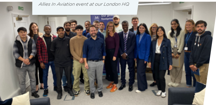
Allies In Aviation event at our London HQ